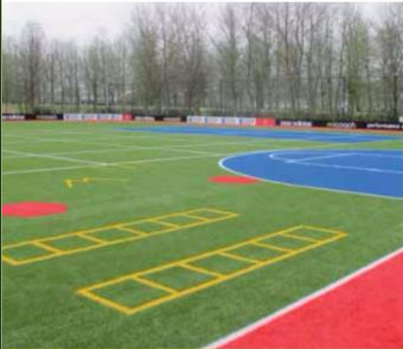
the football equipment at AFC Ajax

One of the elements of training in 'De Toekomst' which is very beneficial for young players is the lack of overtraining; 12-year-old boys only train three times a